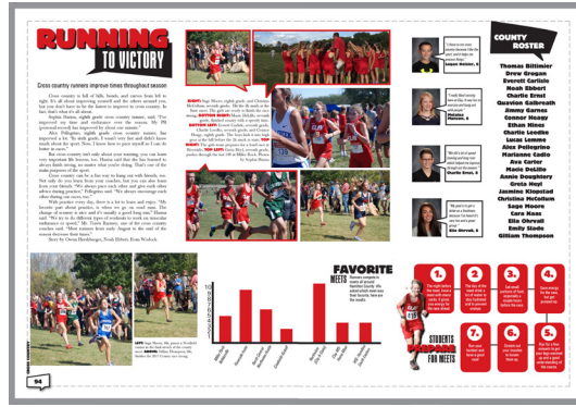
AFTER SQUARE ONE