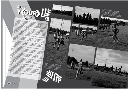
BEFORE SQUARE ONE